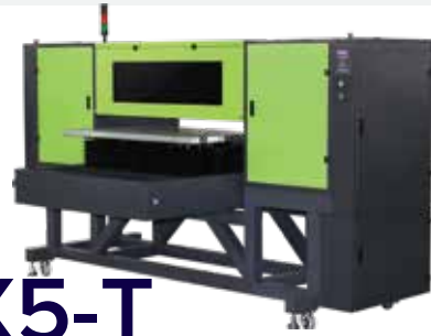
X5 & X5-T